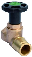
Manifold shut-off valve