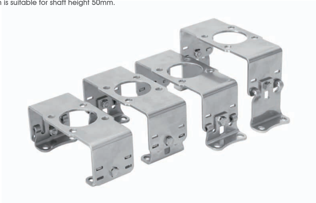
Universal-Bracket 1-3 = for actuators size 1,2,3

These stainless steel universal brackets for mounting limit switch boxes are adjustable in height and width. They are suitable for most common connection interfaces on pneumatic actuators. They allow a reduced stock keeping and flexible application of boxes on various actuator sizes. The bases of the bracket are fastened and secured by form-closed pins and one fixing screw. Thus they can withstand great loads of up to 100 kg without showing deformation and play. Optionally, we offer an additional base-component, which is suitable for shaft height 50mm.